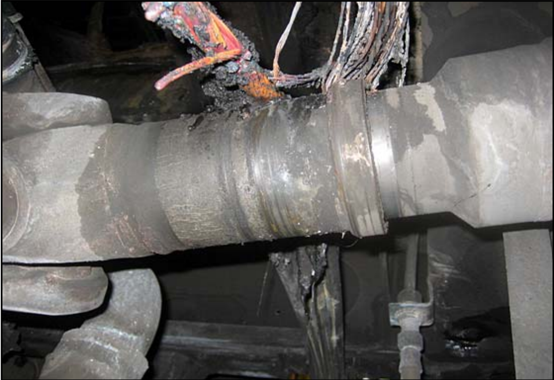
Photograph 2: Electrical loom on tail shaft

that the electrical power was still being supplied from the batteries located at the front offside of the bus after the fire was well underway.