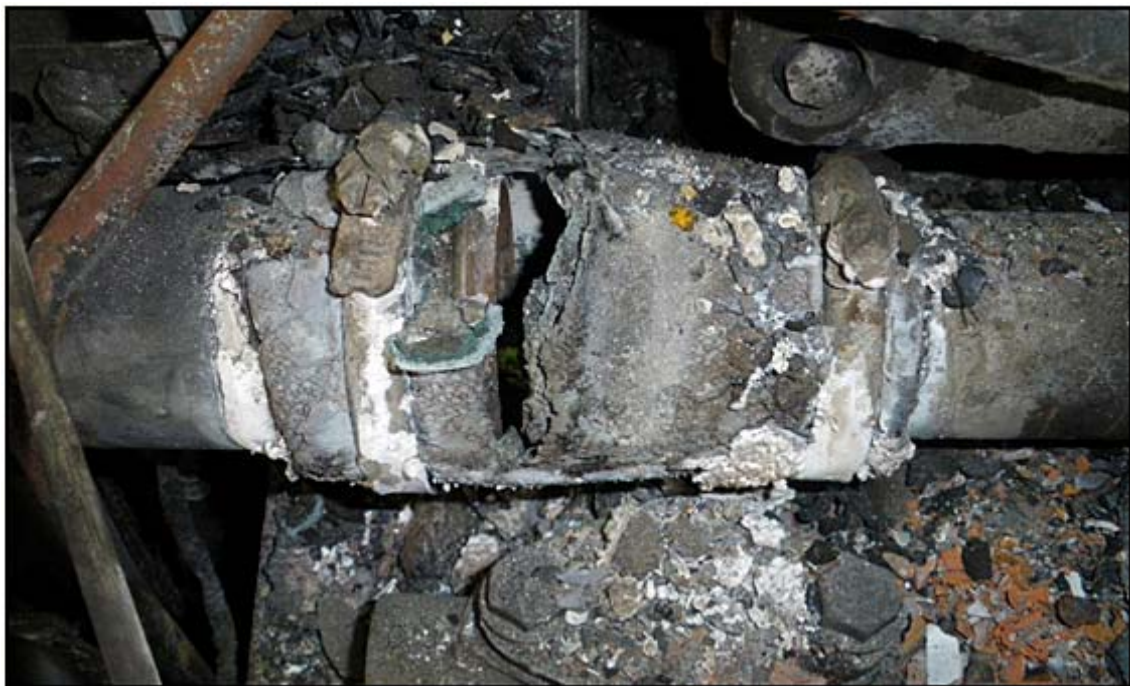
Photograph 6: Main coolant line reduction hose