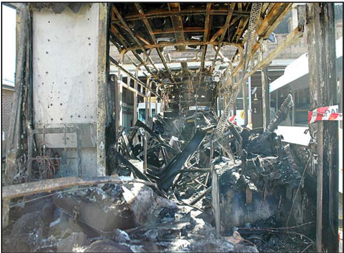
Photograph 1: Bus interior