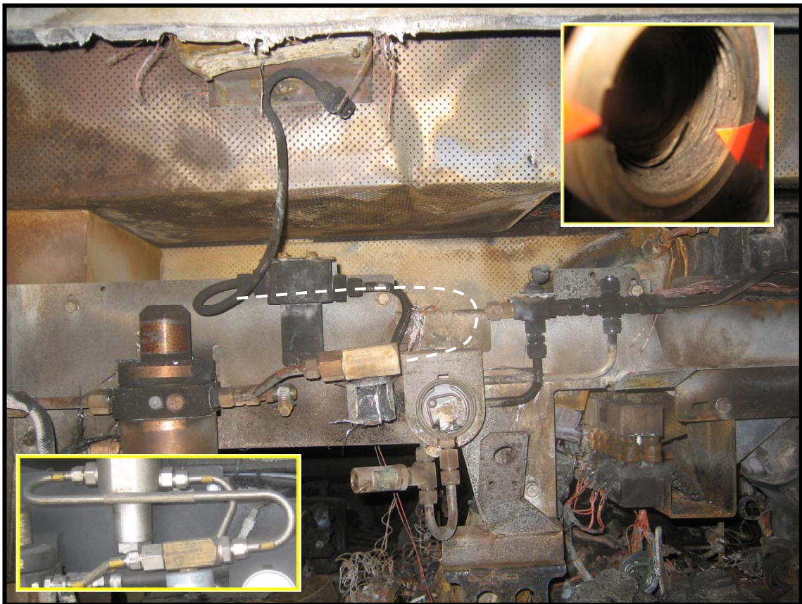
Photograph 3: Ruptured CNG line-compared with an undamaged line