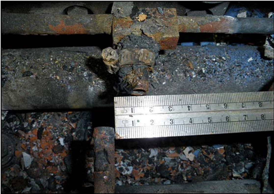
Photograph 5: Coolant return hose fitting misalignment