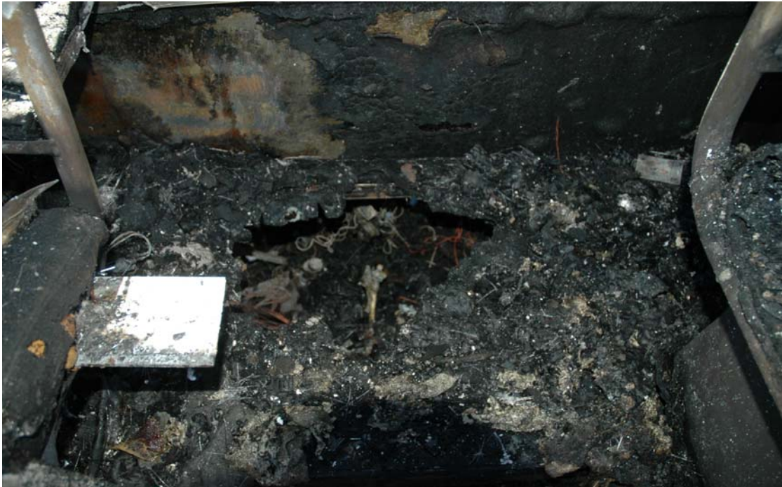
Photograph 8: Rear floor hatches

2.43 The floor hatches were not protected with stainless steel shielding like the other areas of the engine bay except for the rear seat hatch which, despite having some shielding, was still severely damaged. Also, the floor hatches are made of much thinner plywood than the rest of the floor; 12mm compared to 16.2mm. These bus floor hatches provided the area of least resistance to the fire and allowed the flames into the interior of the bus.