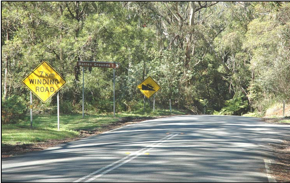
Photograph 4: The "7km Winding Road" sign, including the sign depicting the steep grade ahead.

Photograph 4 depicts road signage further along Jamberoo Mountain Road, approximately 8.5km from the accident site.