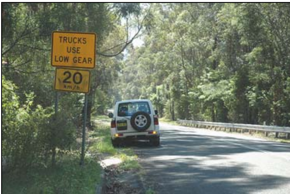
Photograph 5: Jamberoo Mountain Road location approximately 800m before the accident site.

Further down the grade, there are other signs indicating difficult driving conditions and speed restrictions, as depicted in Photograph 5 .