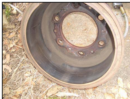
Photograph 7: Discoloured outer brake drum