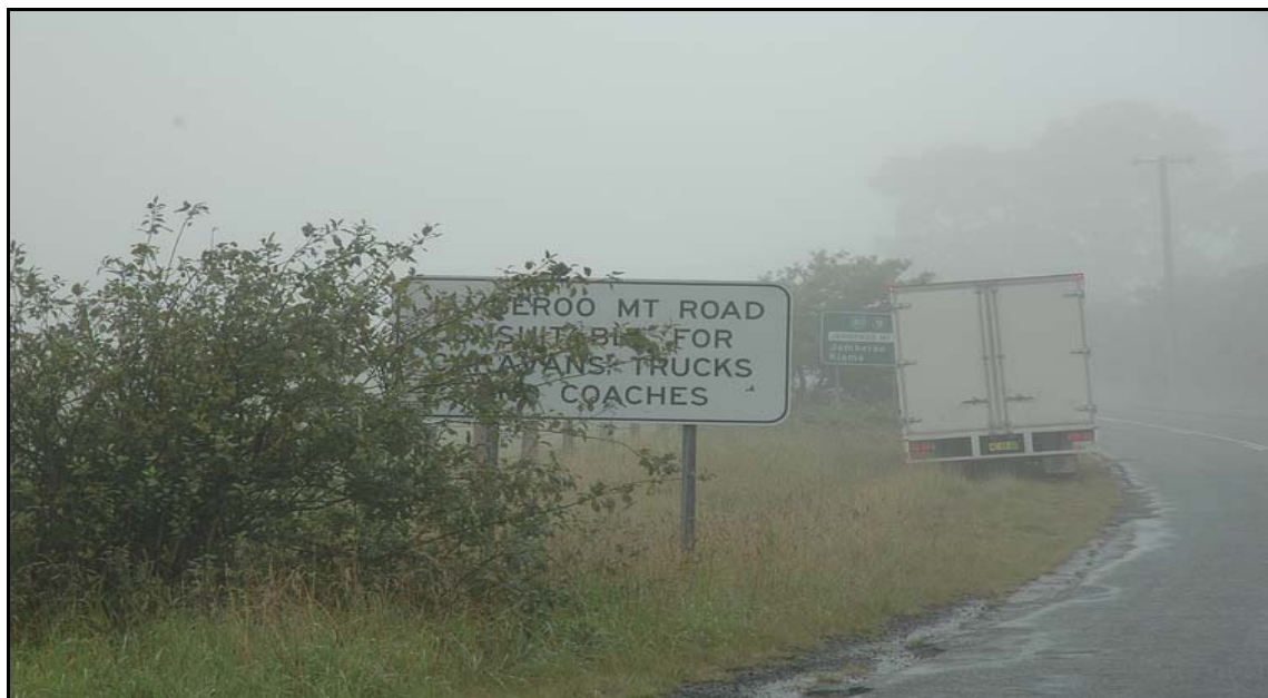
Photograph 3: Signage on Jamberoo Mountain Road, approximately 100m after having turned onto the road from the Illawarra Highway.