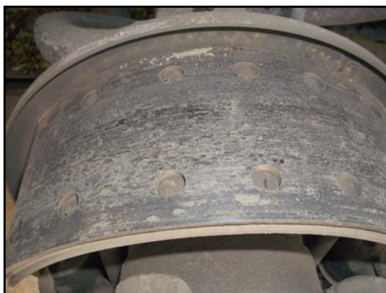
Photograph 6: Glazed brake shoe