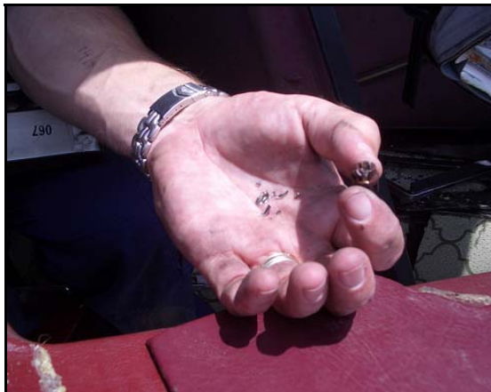
Photograph 8: Pieces of the broken light bulb.