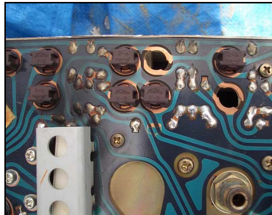
Photograph 9: Back of circuit board