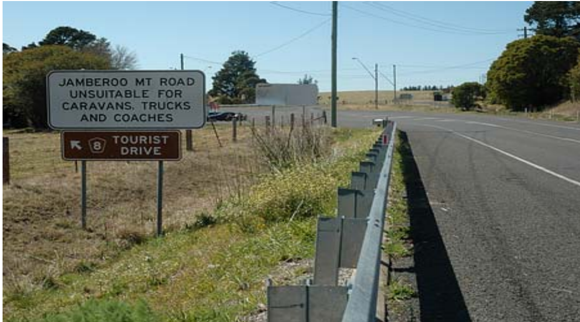
Photograph 2: Signage on the Illawarra Highway, approximately 100m before its intersection with Jamberoo Mountain Road

suitable for caravans, trucks and coaches, as shown in Photographs 2 and 3 . Although the signage on Jamberoo Mountain Road was partially obscured by foliage, the signage on the Highway was not.