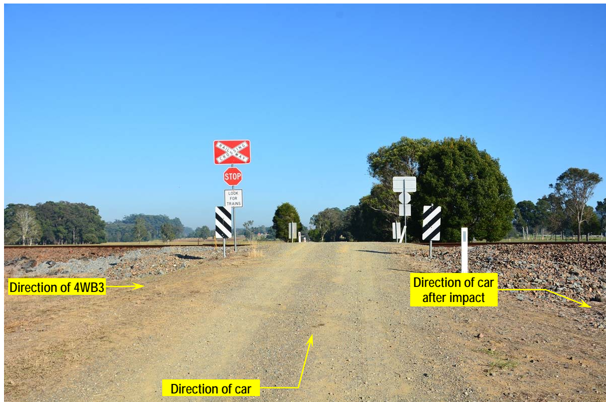
Photograph 1: Henrys Lane level crossing