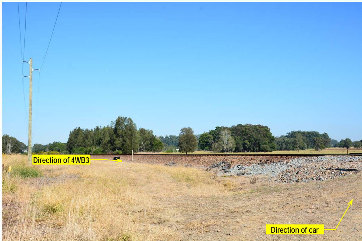
Photograph 3: Location of crossing – looking in direction of the approaching train